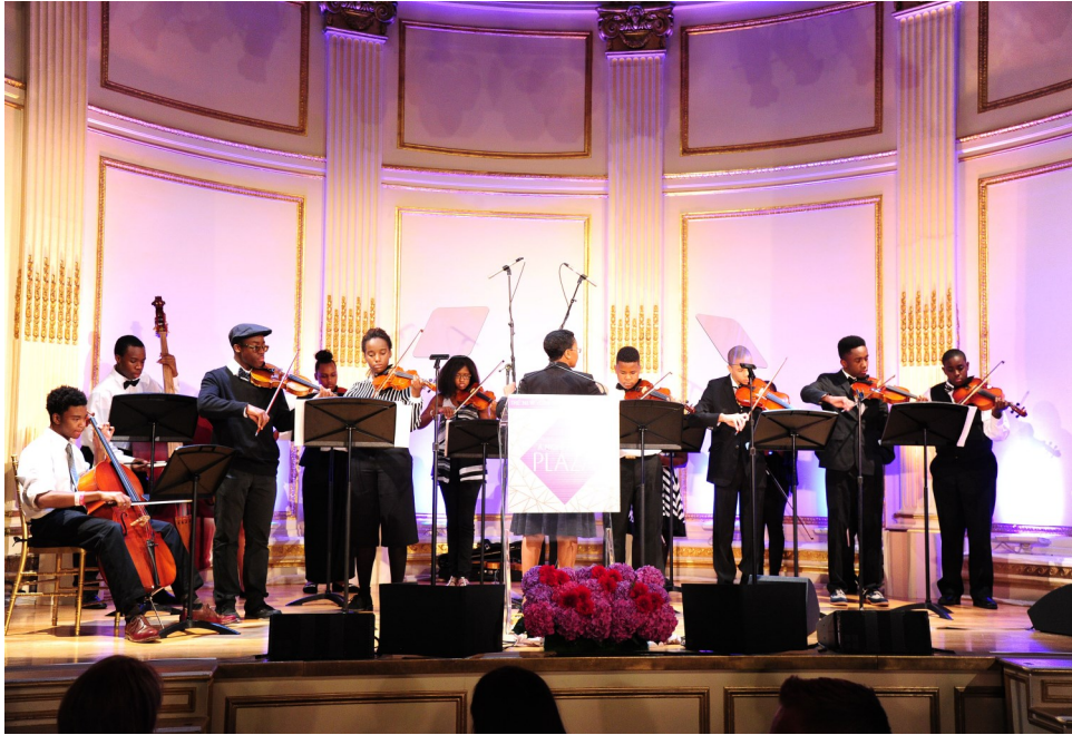
Brighton Heights Youth Orchestra performing at The New York Women's Foundation's A Night at the Plaza on October 15th, 2015